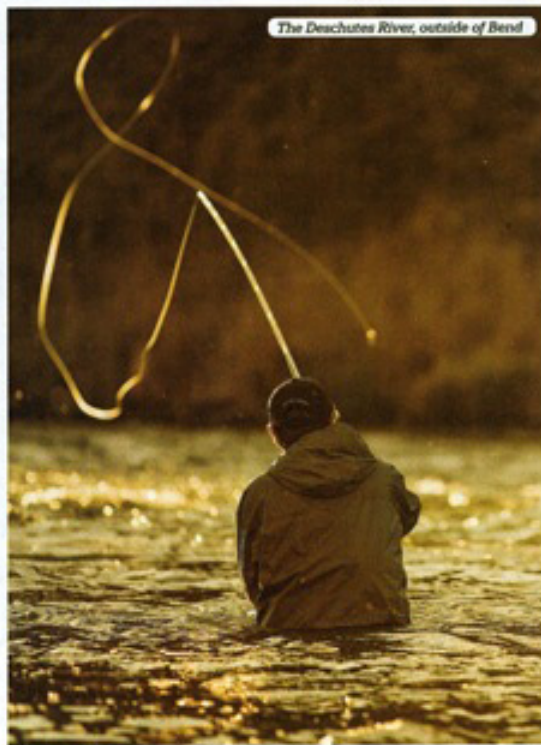
The Deschutes River, outside of Bend